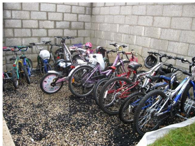
Our new bicycle racks are already full! Thanks to the Board of Management for encouraging us to go green.